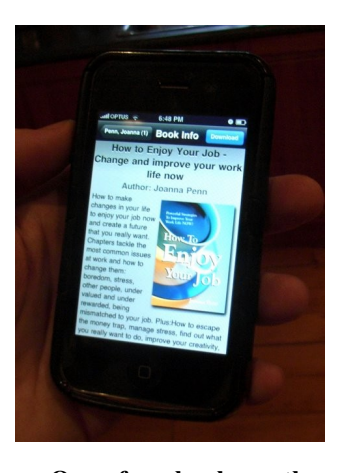
One of my books on the iPhone Stanza app

PLUS: Check out this article on Amazon, ebooks and the potential Apple tablet coming in 2010 that may be the iPod for ebooks.