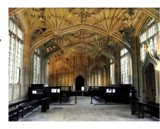
The Divinity School, Bodleian Library, Oxford

PLUS: Aspiring travel writers, check out the <u>podcast with Alastair</u> <u>Humphreys here</u>